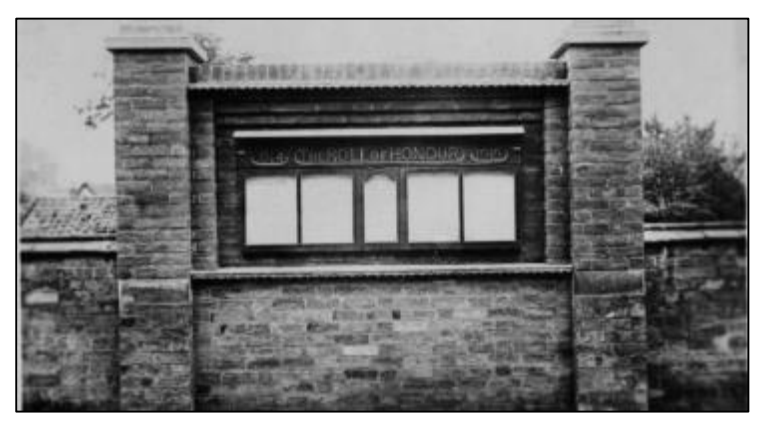
Before the Memorial Hall was built the Roll Of Honour to those Swavesey men who died in the Great War, was fixed onto a plinth between two brick pillars on the frontage of the site.

Attended by: Lord Lieutenant of Cambridgeshire (and Isle of Ely);